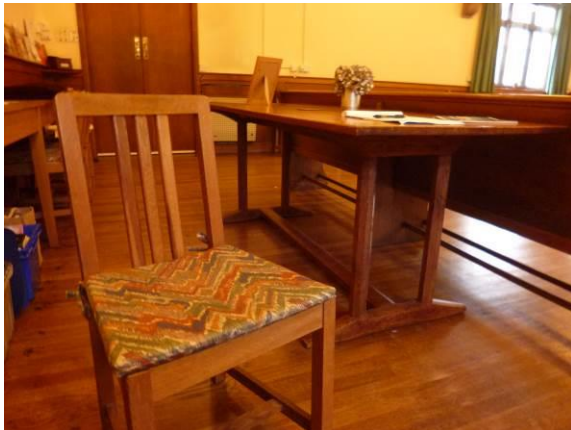
Fig.2: Bryn Mawr oak chair and table