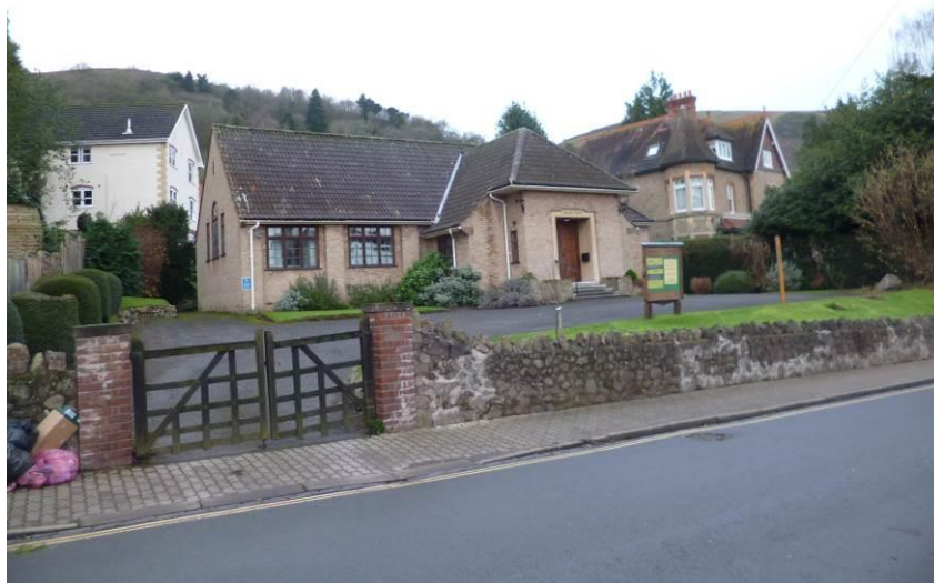
Fig.4: the setting of the meeting house