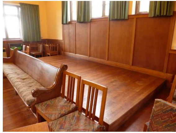
Fig.3: Bryn Mawr bench and chairs